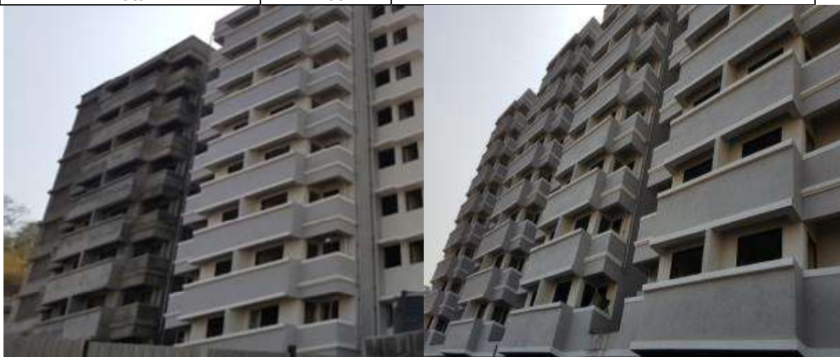
Status of construction of BSUP housing units