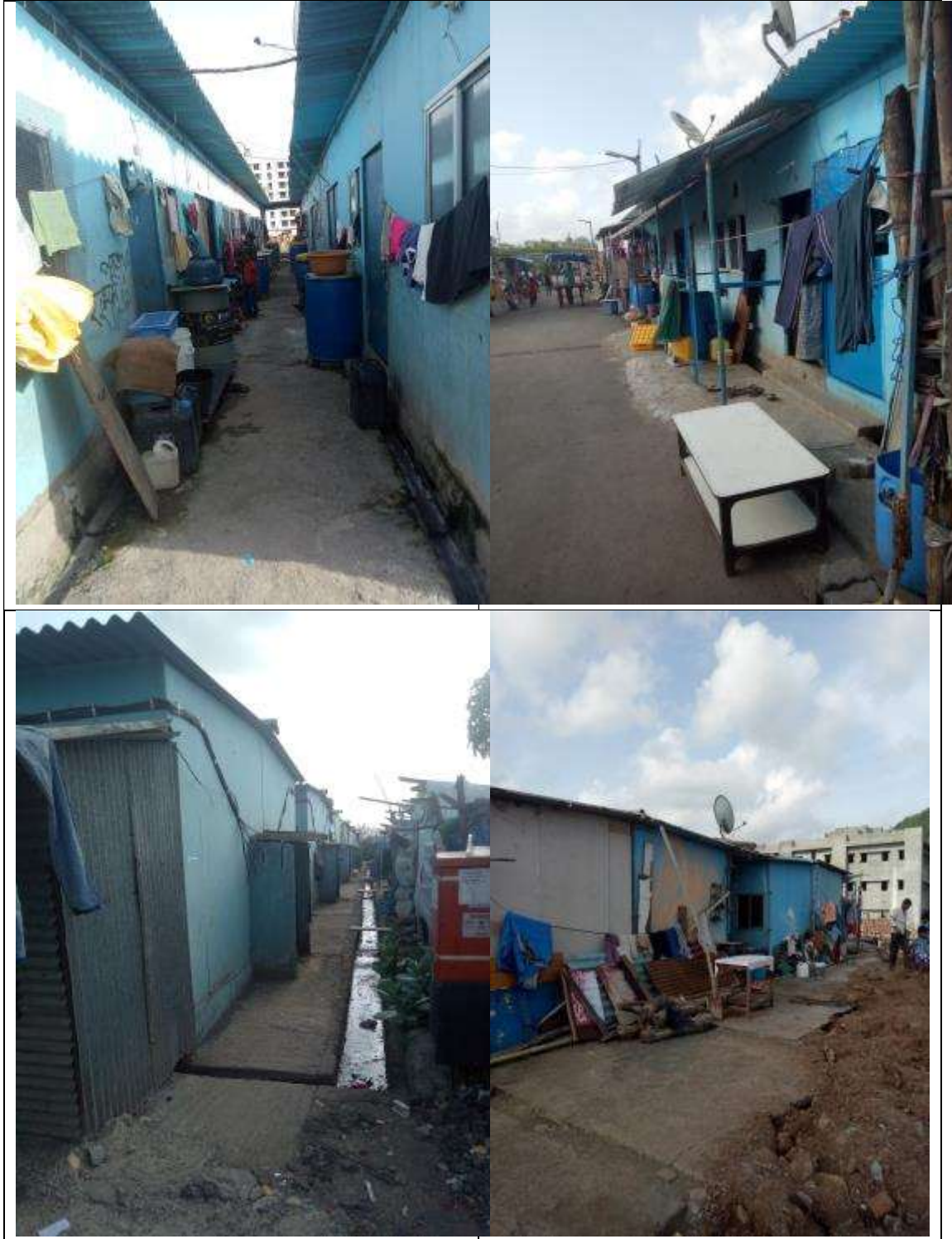
Status of J-2 Transit Camp Relocated 38 Slum Dwellers